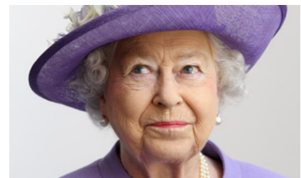
HRH Queen Elizabeth II 1926 - 2022

Kindergarten spent some time this week thanking the Queen for her service. We went to the school chapel and shared our thoughts with our friends.