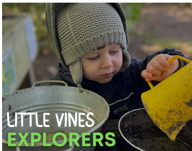
LITTLE VINES EXPLORERS

The Little Vines Toddler Groups are a great introduction to school, offering a supportive network for parents as well as the opportunity for children to develop their communication skills and learn through exploration.