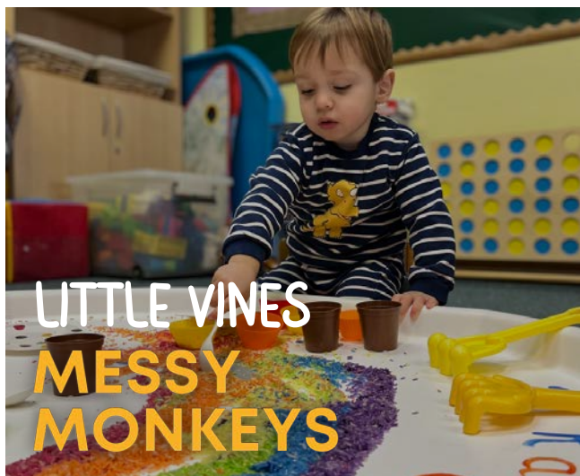
LITTLE VINES MESSY MONKEYS