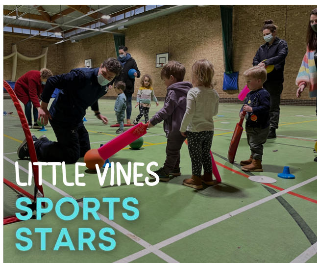
LITTLE VINES SPORTS STARS